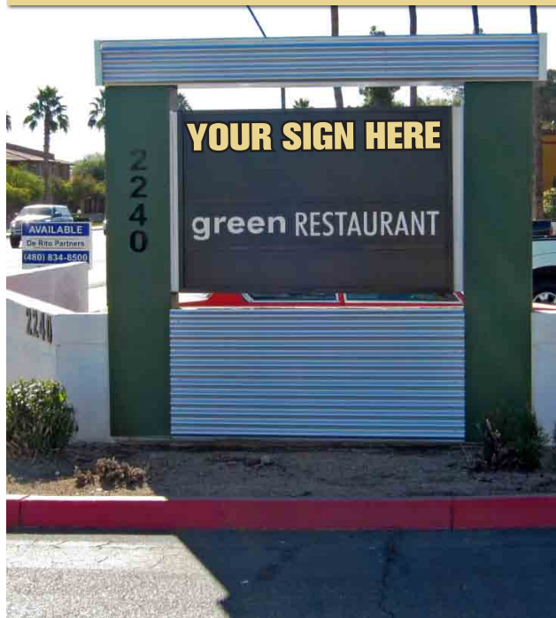
MONUMENT SIGNAGE ON SCOTTSDALE RD