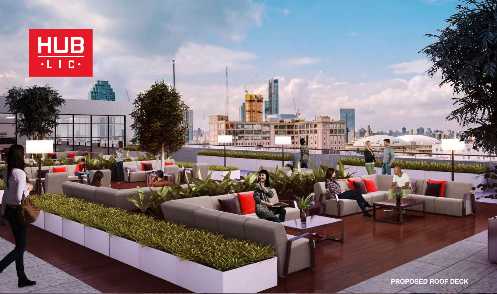
PROPOSED ROOF DECK