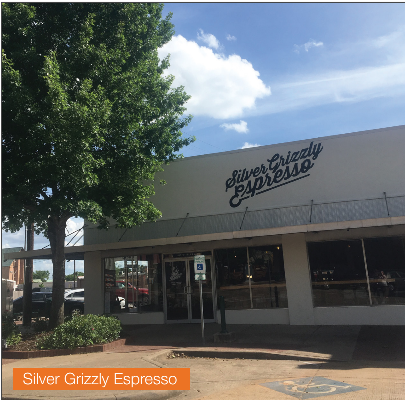
Silver Grizzly Espresso