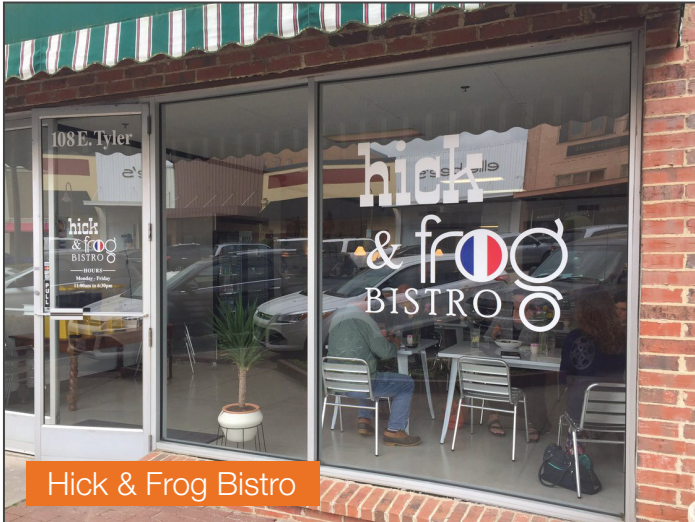
Hick & Frog Bistro