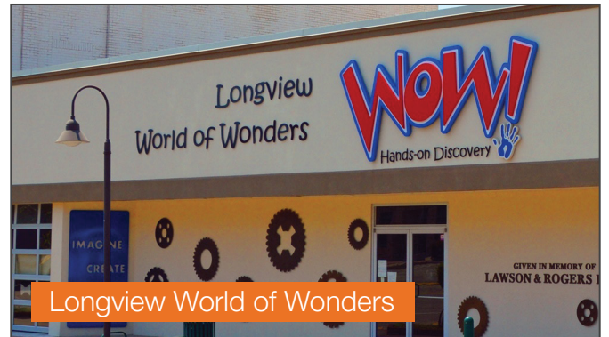
Longview World of Wonders