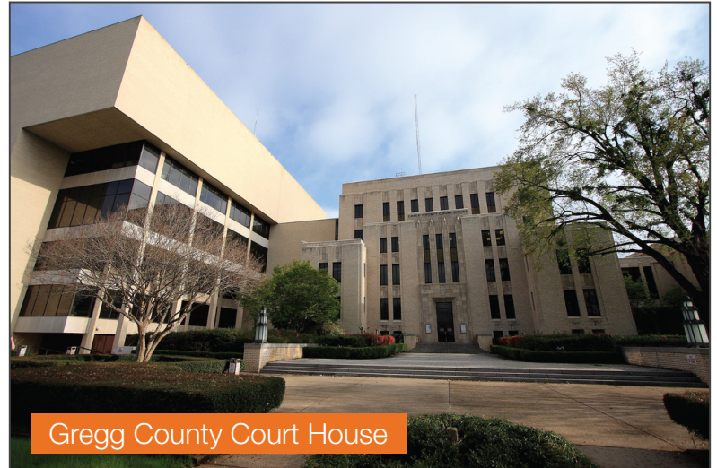
Gregg County Court House