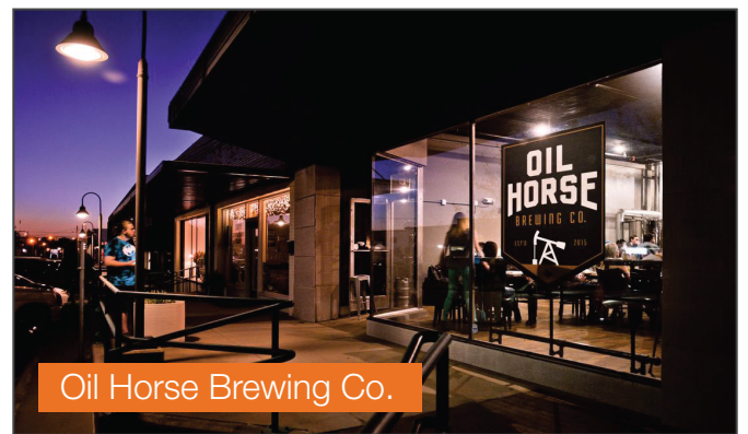
Oil Horse Brewing Co.