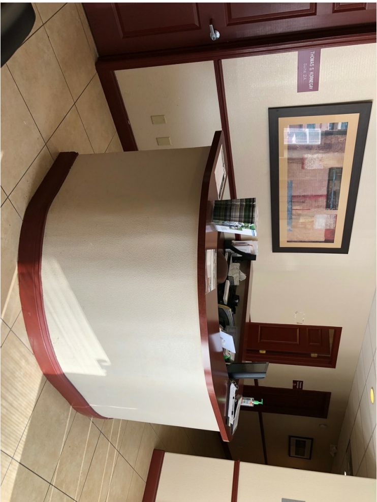
Reception Desk 1st Floor