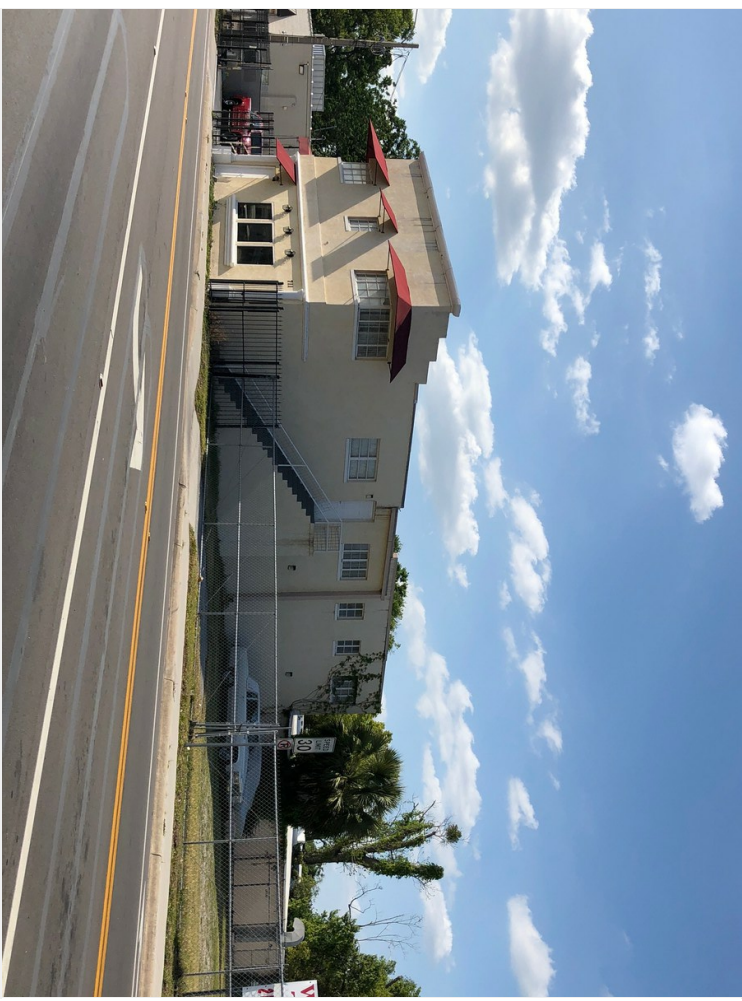
Exterior, east and south side