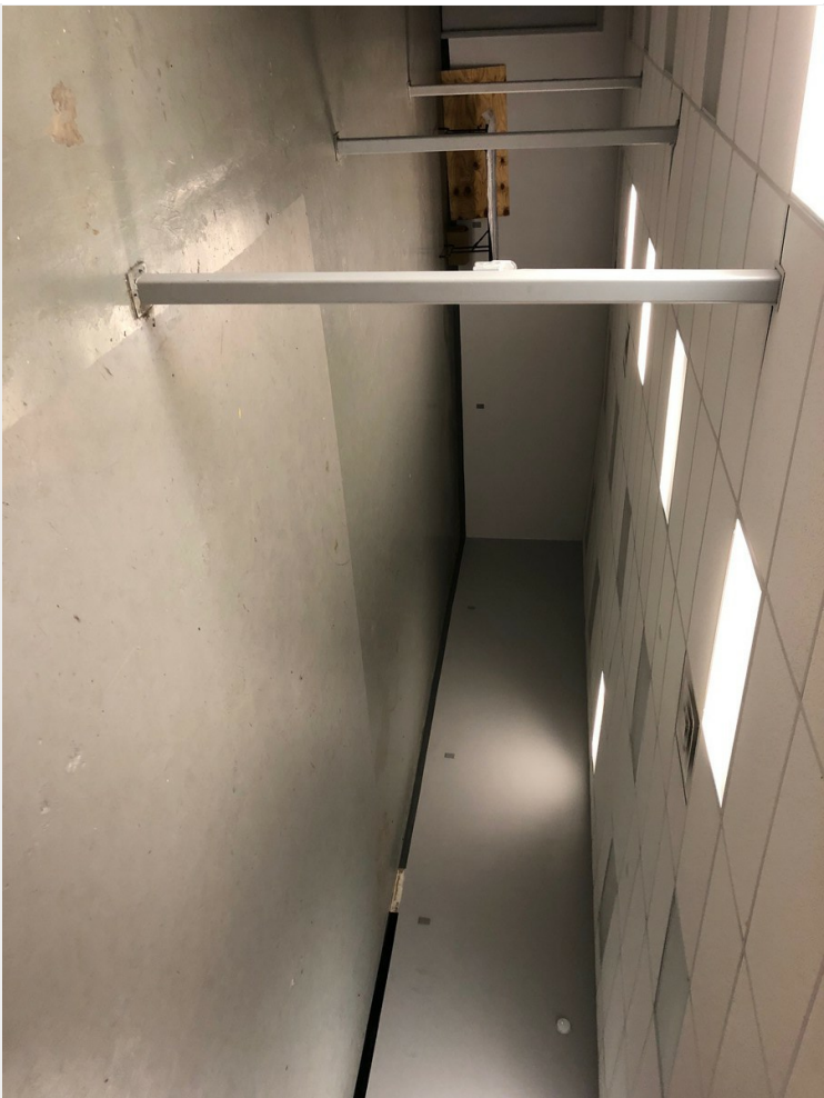
Open Work Space (A/C'd warehouse)