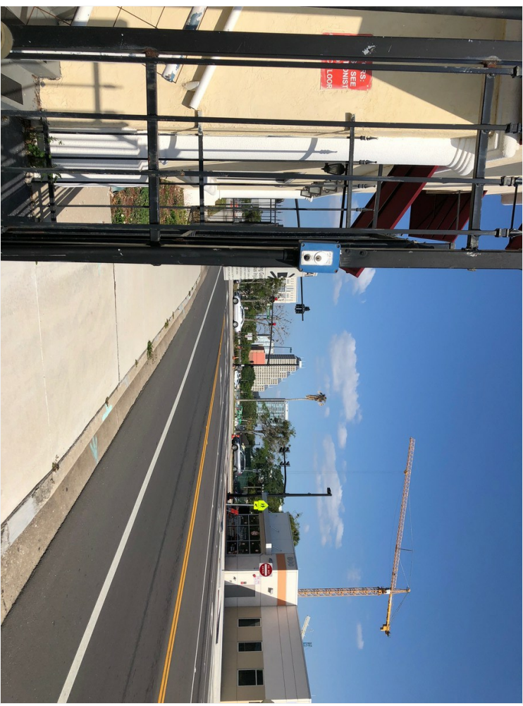
View of Creative Village Construction