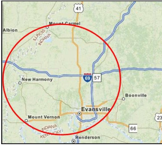
EVANSVILLE'S WEST SIDE CONSUMER AREA