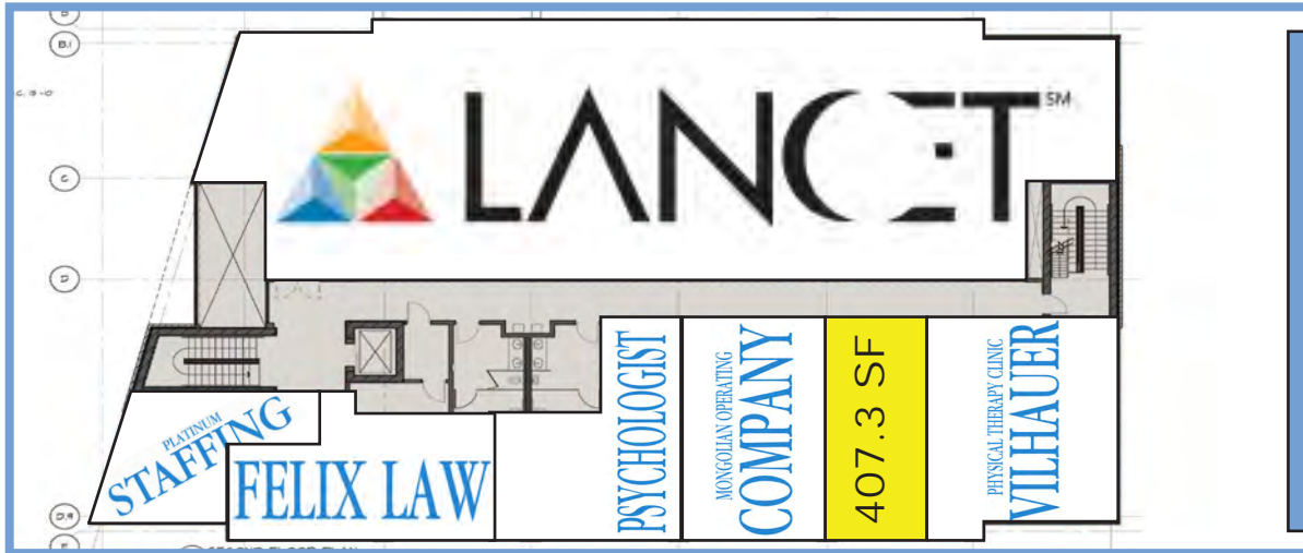
Office/Professional Bldg. Second Floor Plan