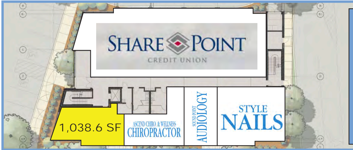
Office/Professional Bldg. First Floor Plan

Highway 13 & Nicollet Avenue | Burnsville, MN, 55337