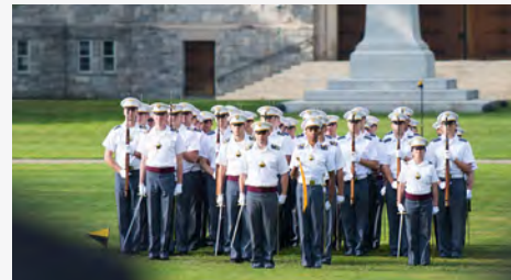
The USMA at West Point