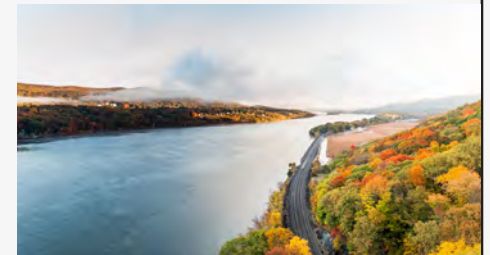
Bear Mountain State Park