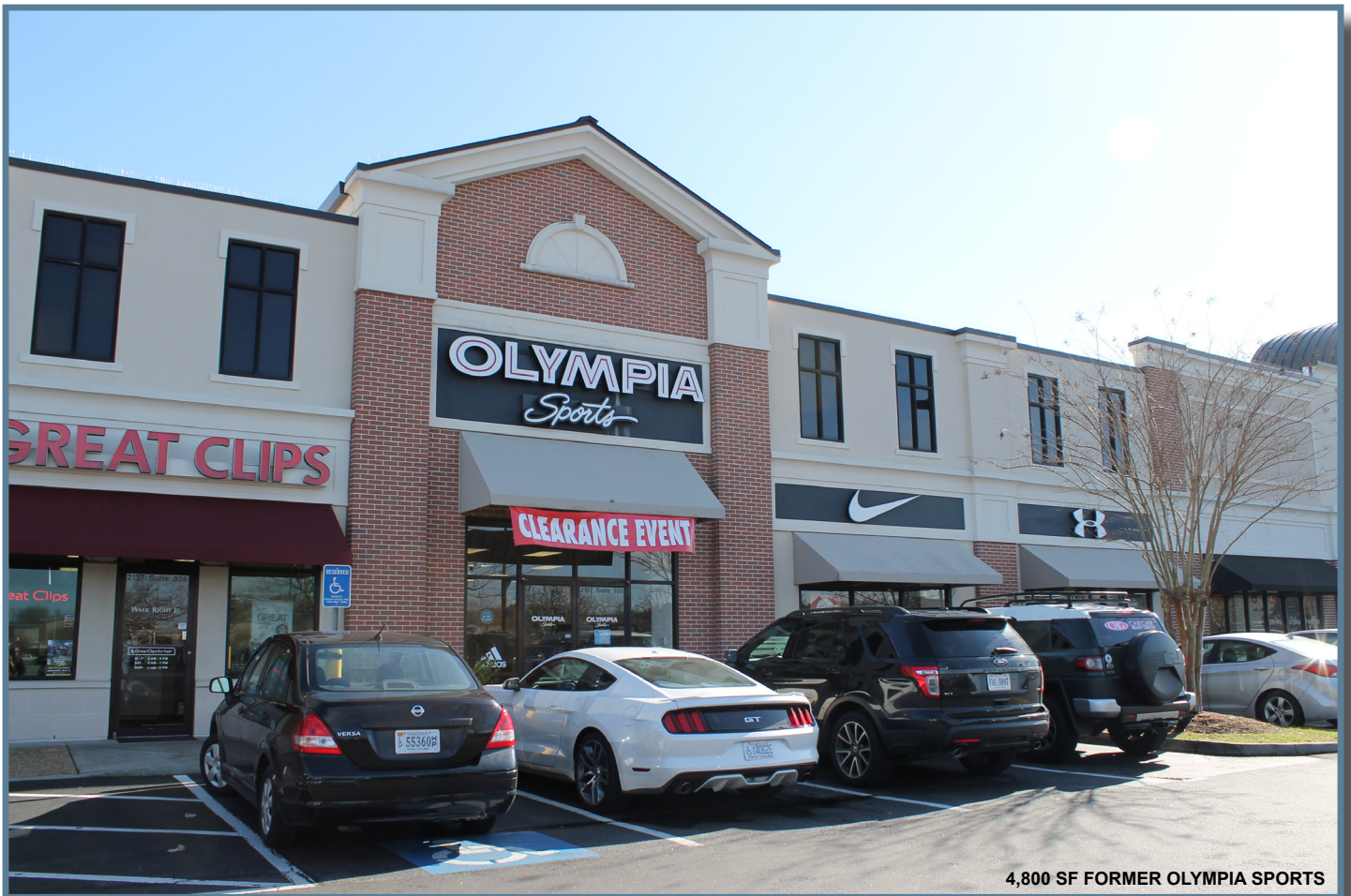
4,800 SF FORMER OLYMPIA SPORTS