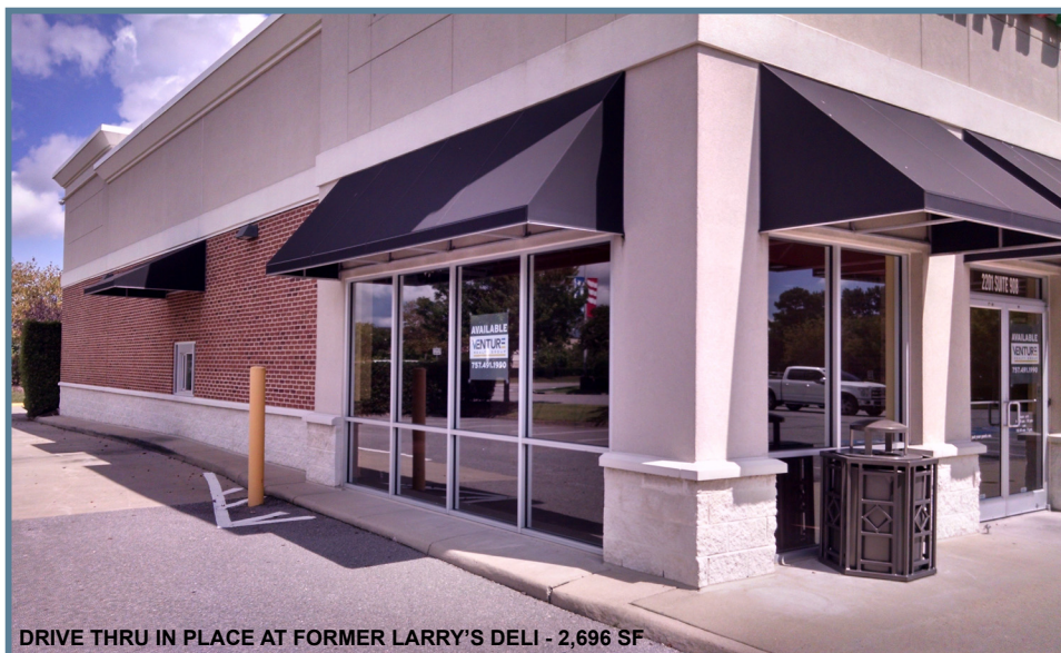
DRIVE THRU IN PLACE AT FORMER LARRY'S DELI - 2,696 SF