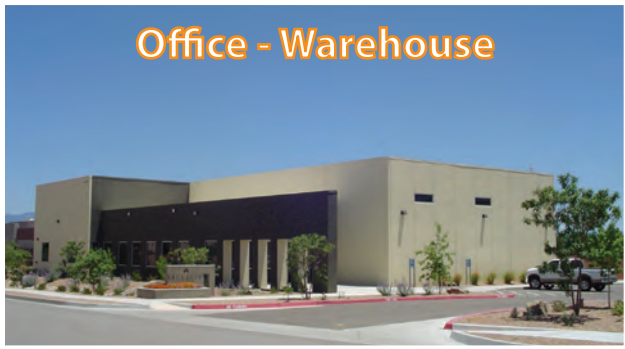
Office - Warehouse

Brunacini Development Limited Company develops, constructs, leases, and owns commercial real estate throughout the greater Albuquerque area, specializing in industrial and office projects. To every job Brunacini Development brings a comprehensive approach, inherent flexibility, extensive experience and an unparalleled commitment to high quality.