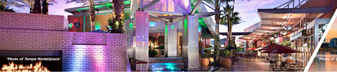
*Photo of Tempe Marketplace