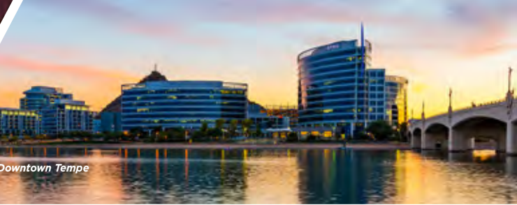
*Photo of Downtown Tempe