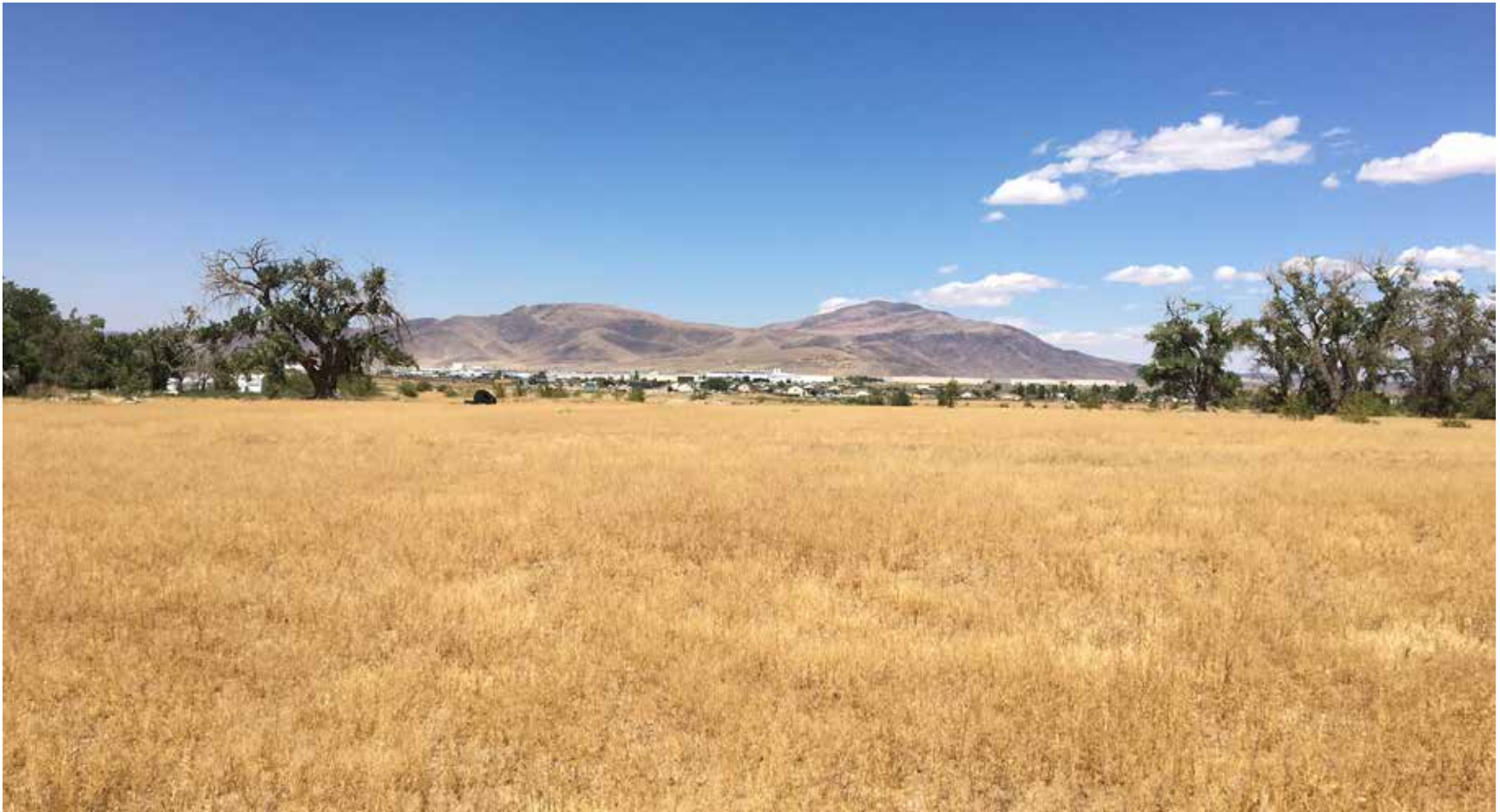
Looking north from Farm District Road