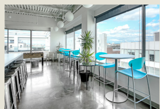
Expansive Window Lines