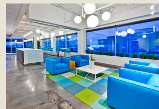
Modern Office Spaces