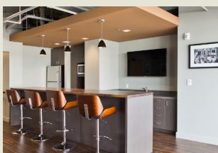
Tenant Lounge Area