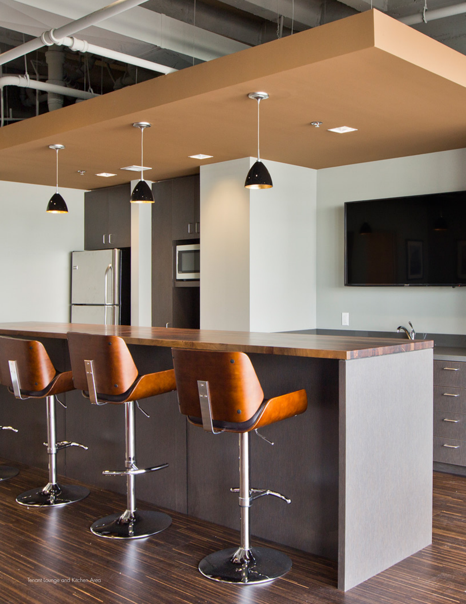
Tenant Lounge and Kitchen Area