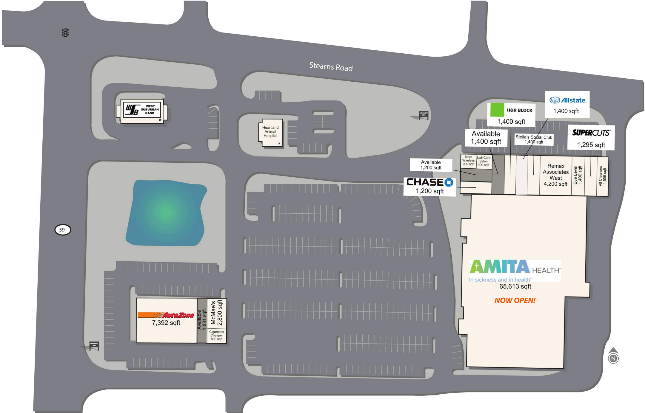
Property Lineup and Square Footage