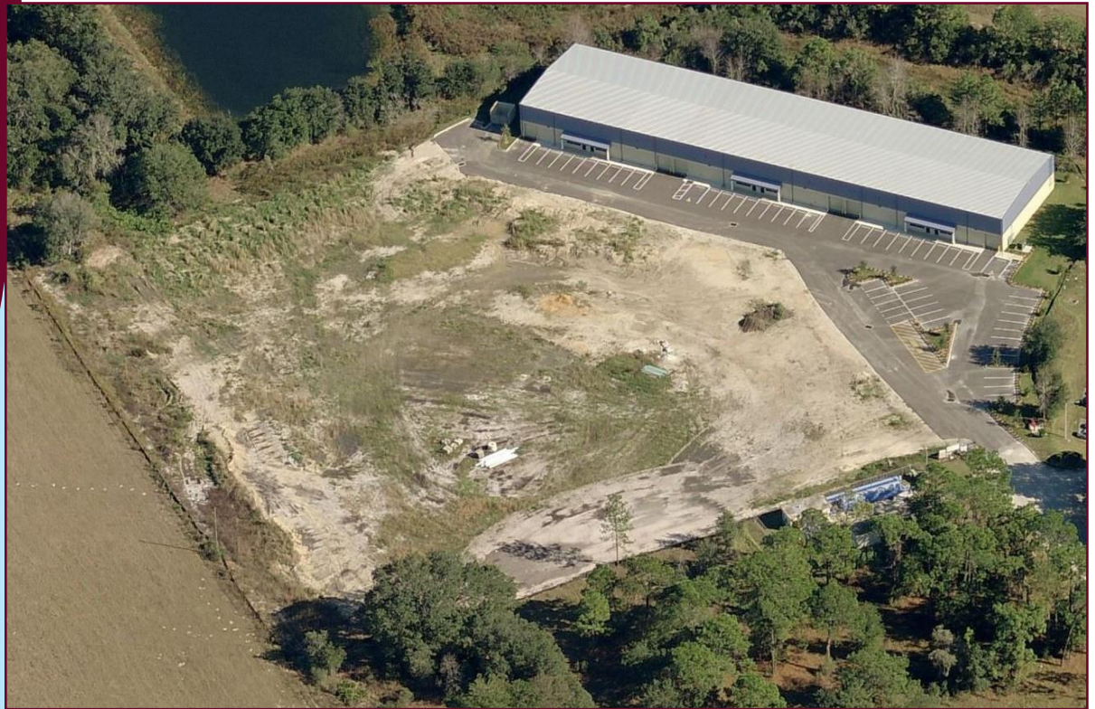
Warehouse plus 6.5 acres in One Pasco Center