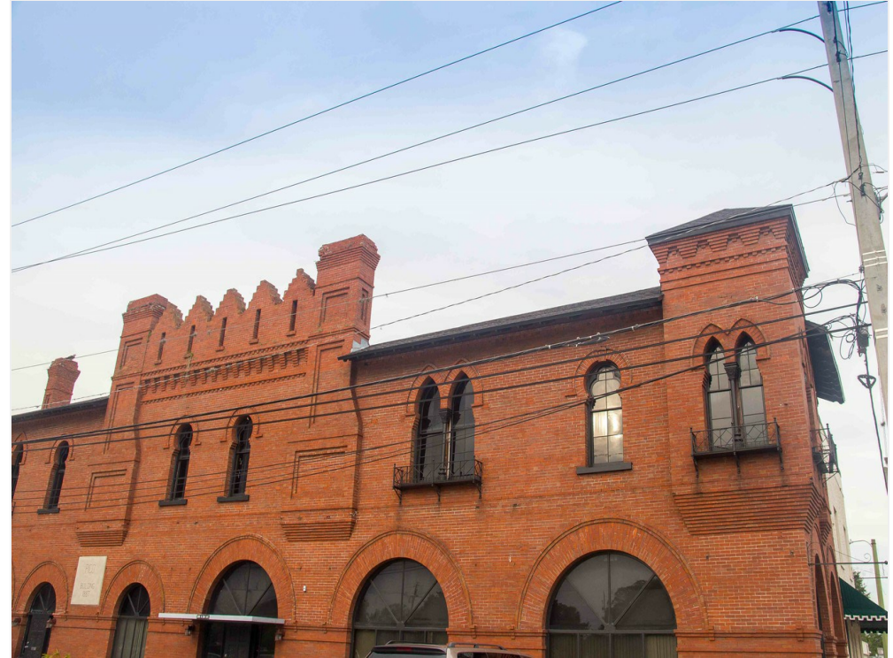
The original window arches had been preserved