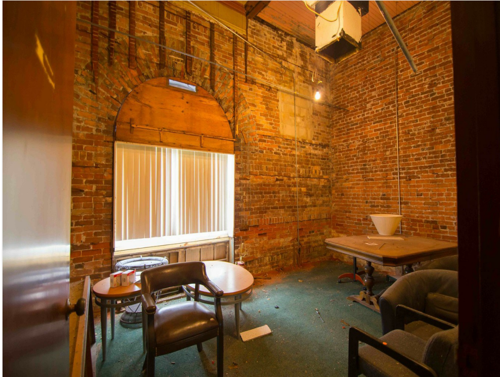
1st floor left wing - Unfinished office space with original exposed red brick