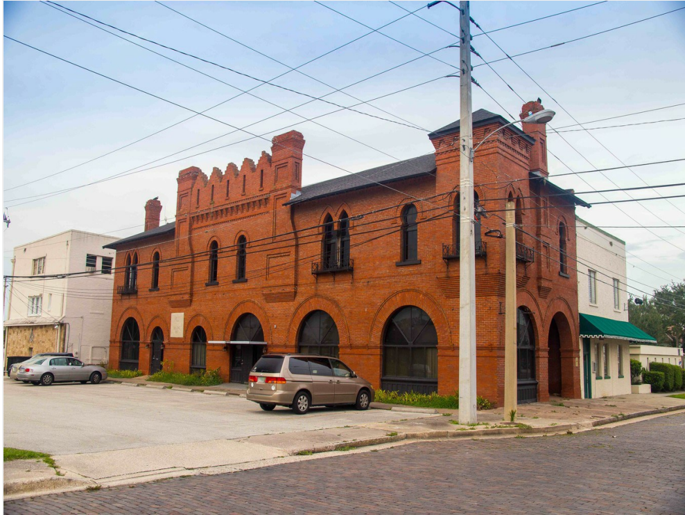
The street view of the right corner of the PICO Building