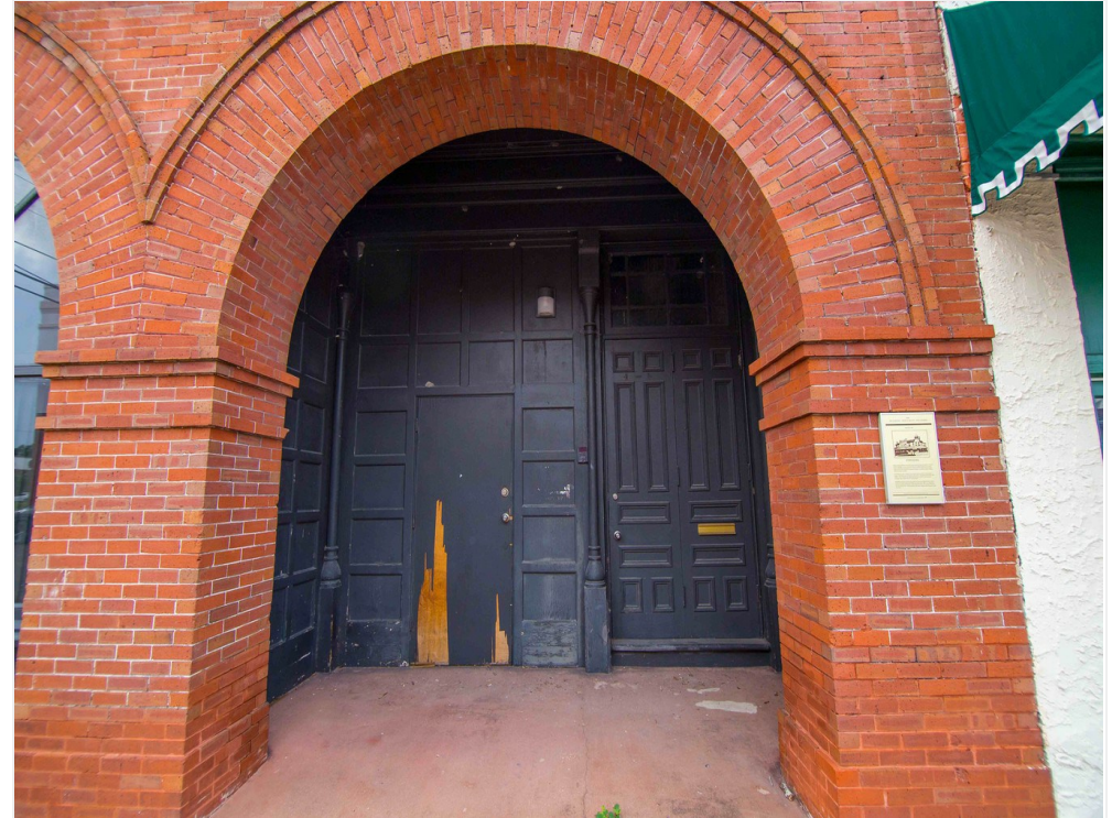
Door to 2nd floor on the right corner of PICO & plaque of National Historic Place Registry