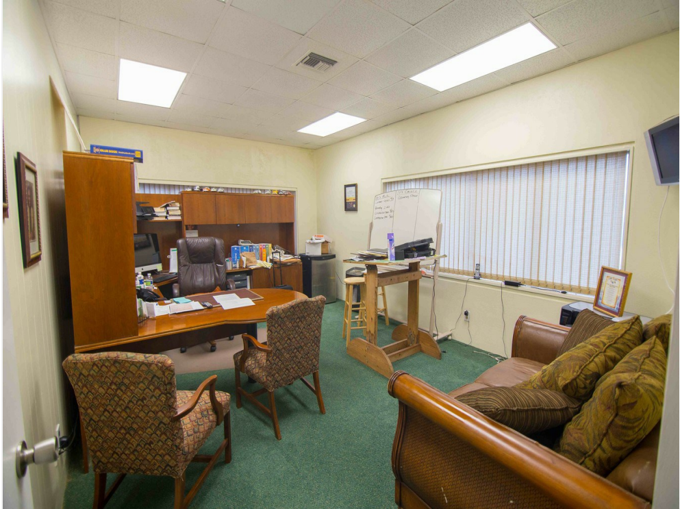
1st floor right wing of the building - Manager's office