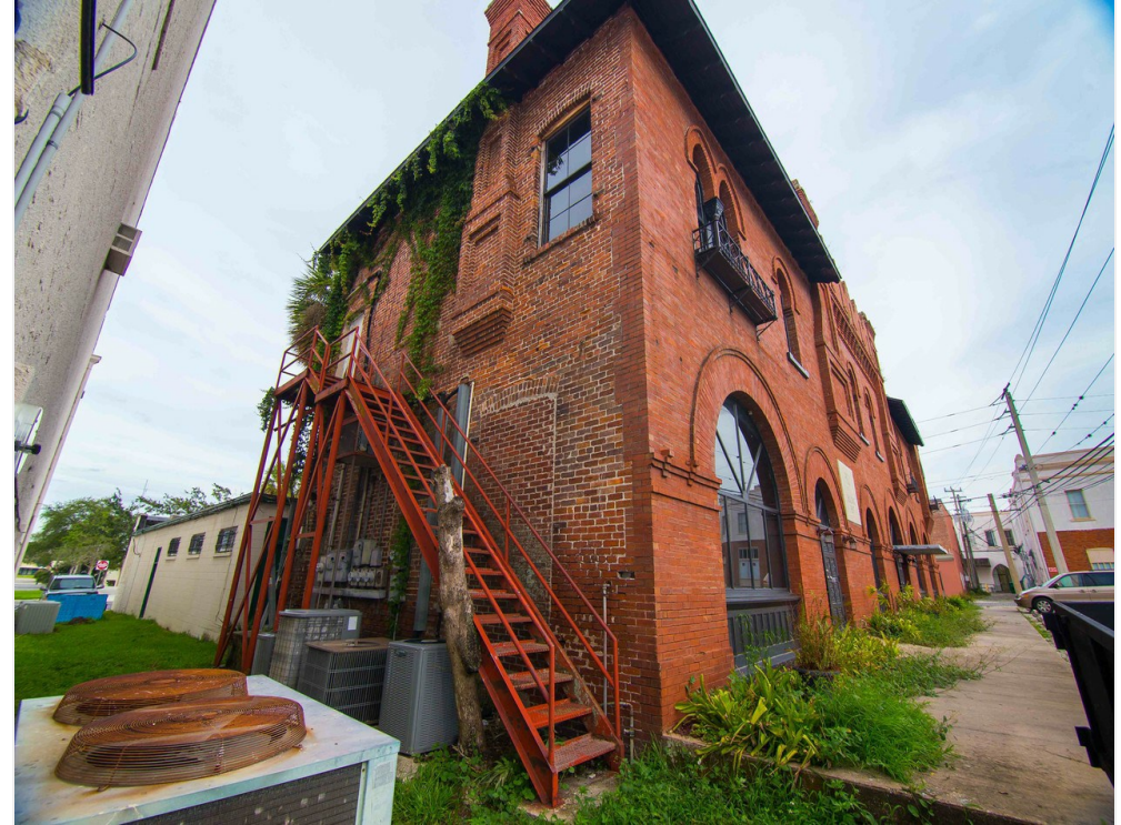
The left corner of the building and metal stairs to the 2nd floor