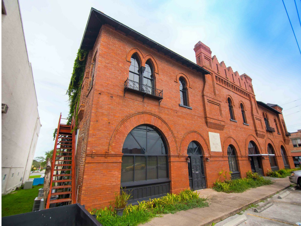
The left corner of the PICO Building