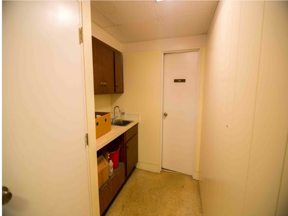
1st floor - Bathroom 1 of 4