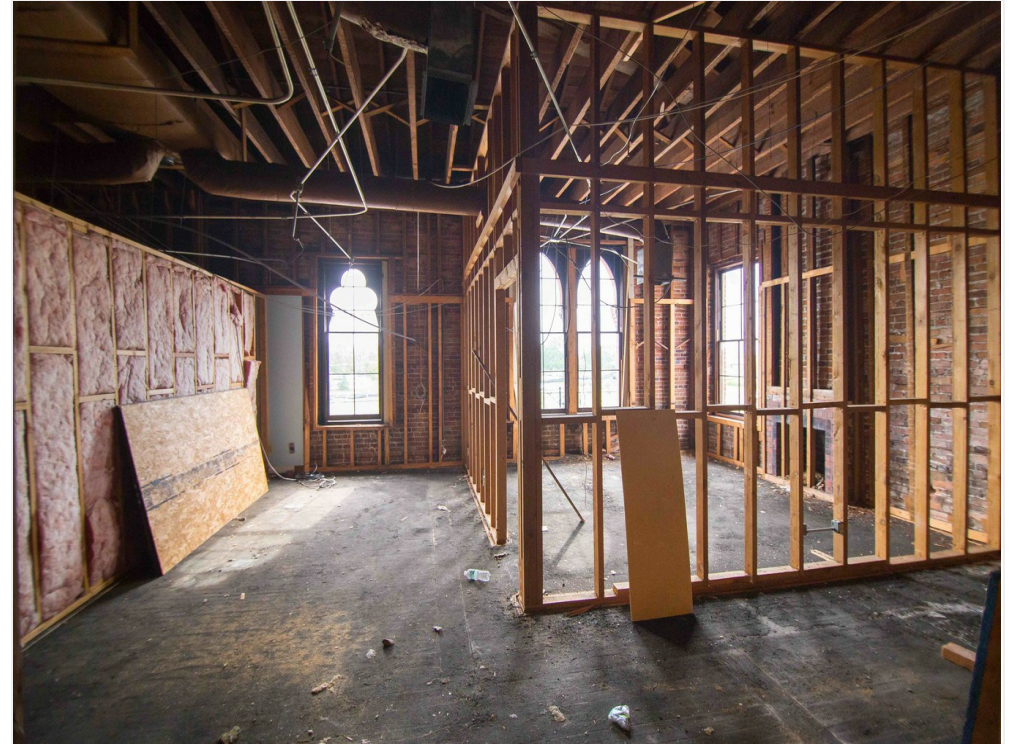
The side view of that space which is on the far right by the exit door outside through the metal sta