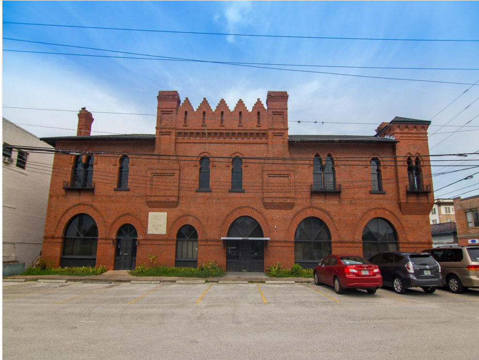
Office Building - Historic PICO Building in beautiful Downtown Sanford