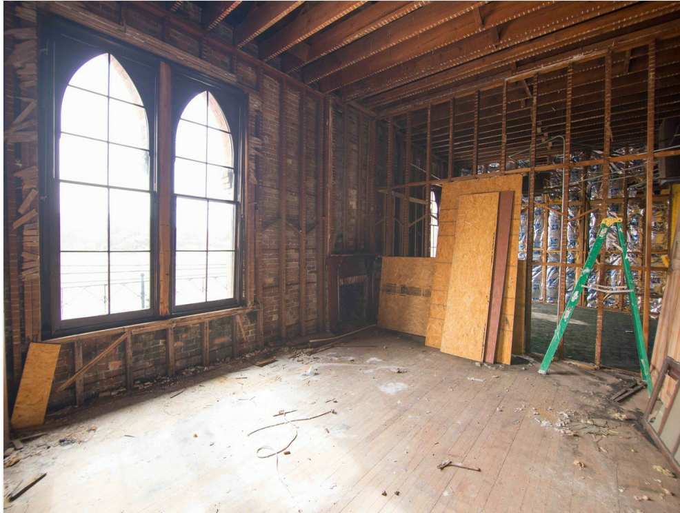
Another view of preserved window arches and one more fireplace