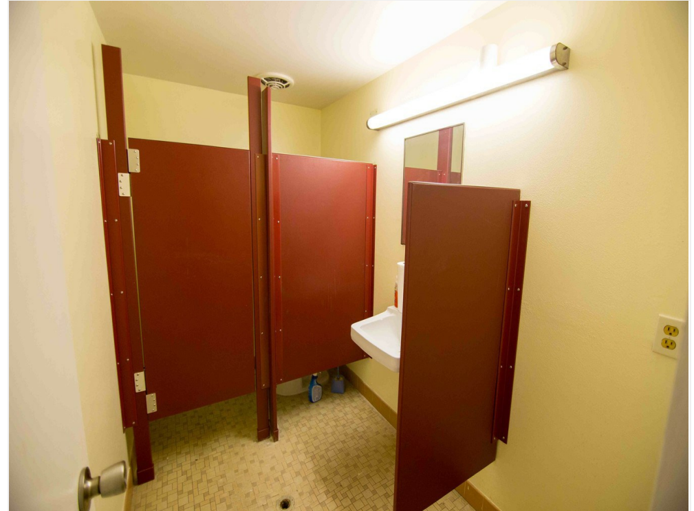
1st floor - Bathroom 2 of 4