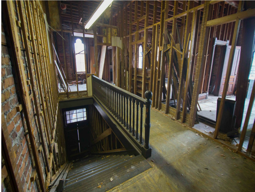
2nd floor entry way with the original beautiful railing