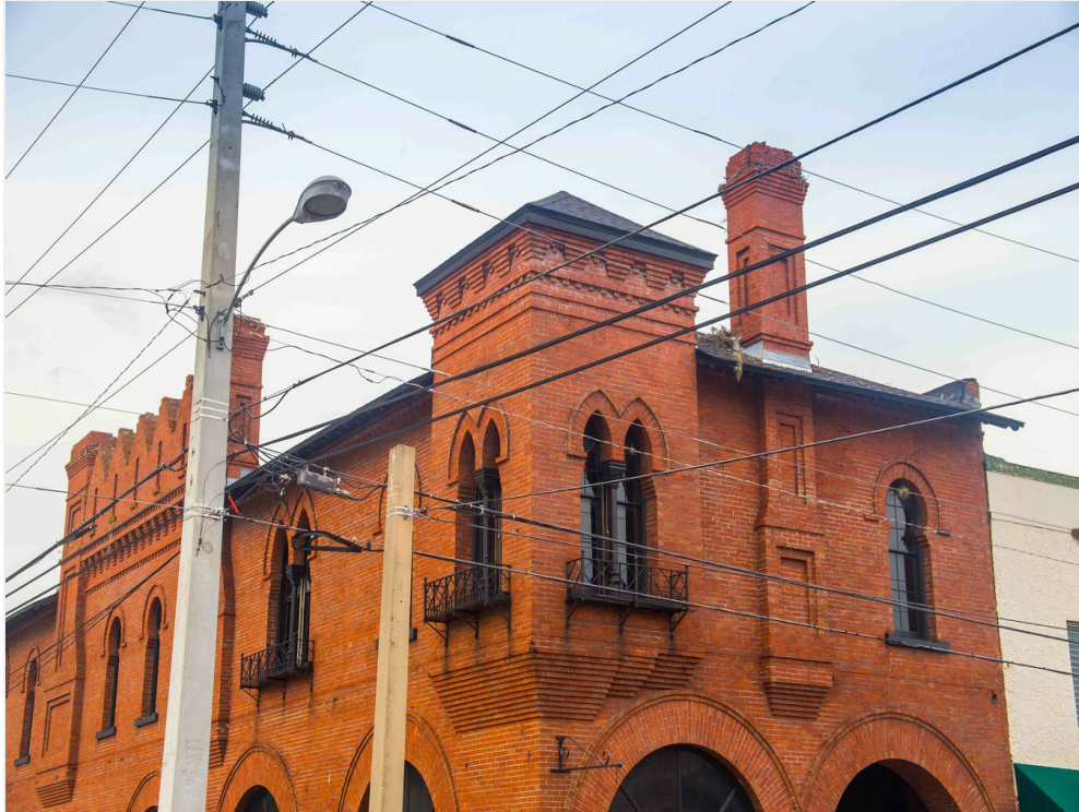
The balcony on the right corner with the original wrought iron railing