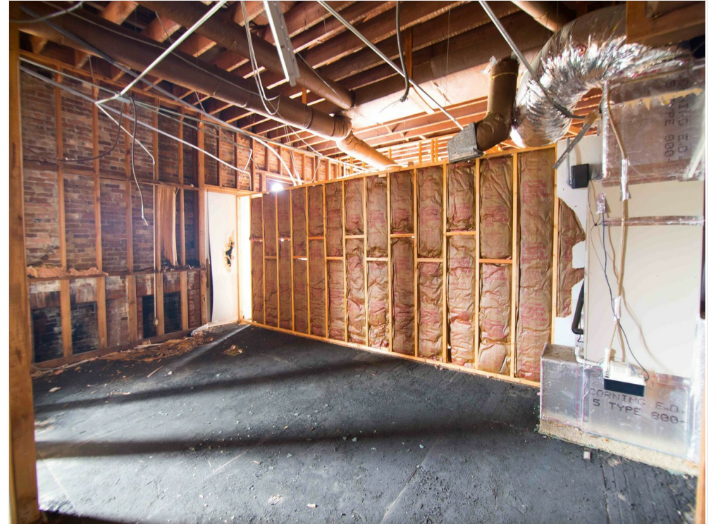
Modern style insulation and air conditioning. One more fire place.