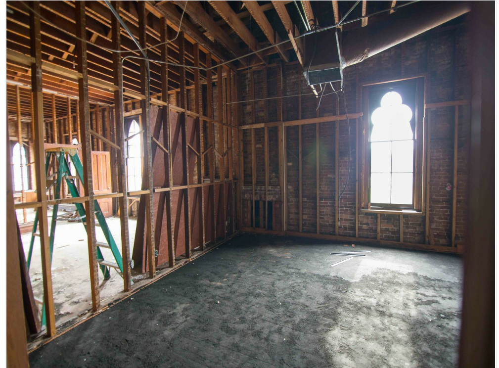
Another view of that space from the opposite side.