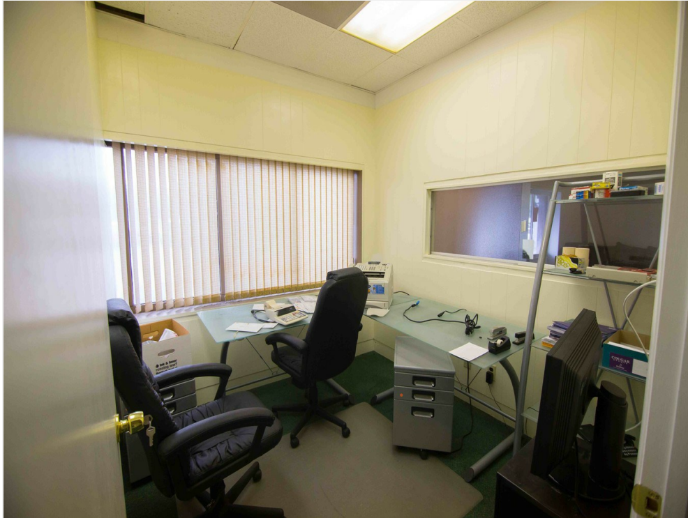
1st floor one of the office spaces in right wing