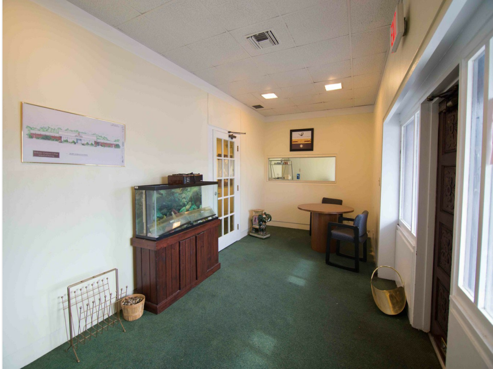
1st floor Reception area with view of entrance to the offices