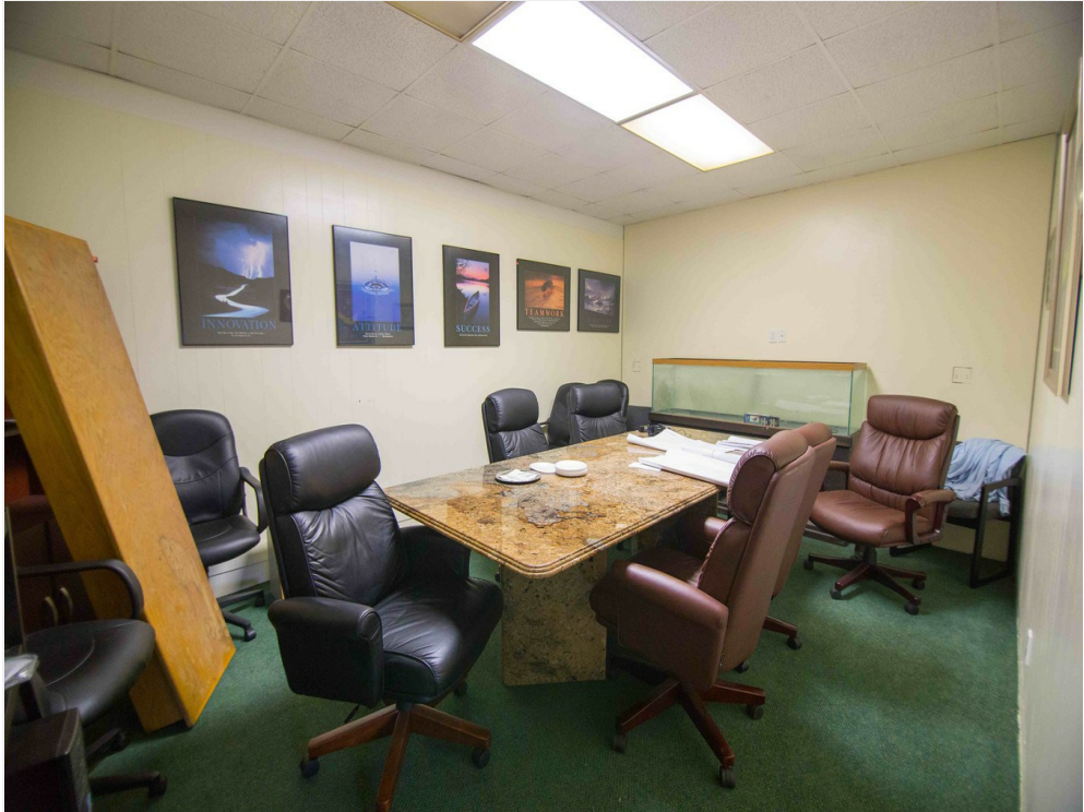
1st floor right wing of the building - Conference Room