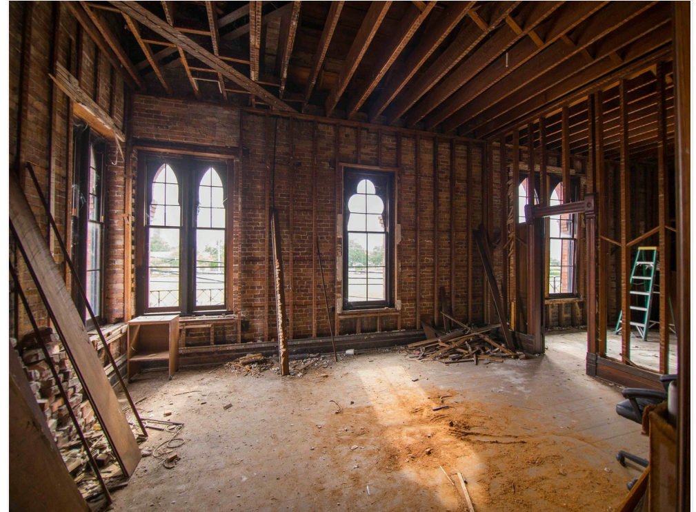
2nd floor unfinished space with the view of the beautiful window arches and one of the 9 fireplaces