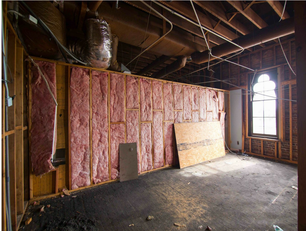
The opposite side of that wall with the insulation