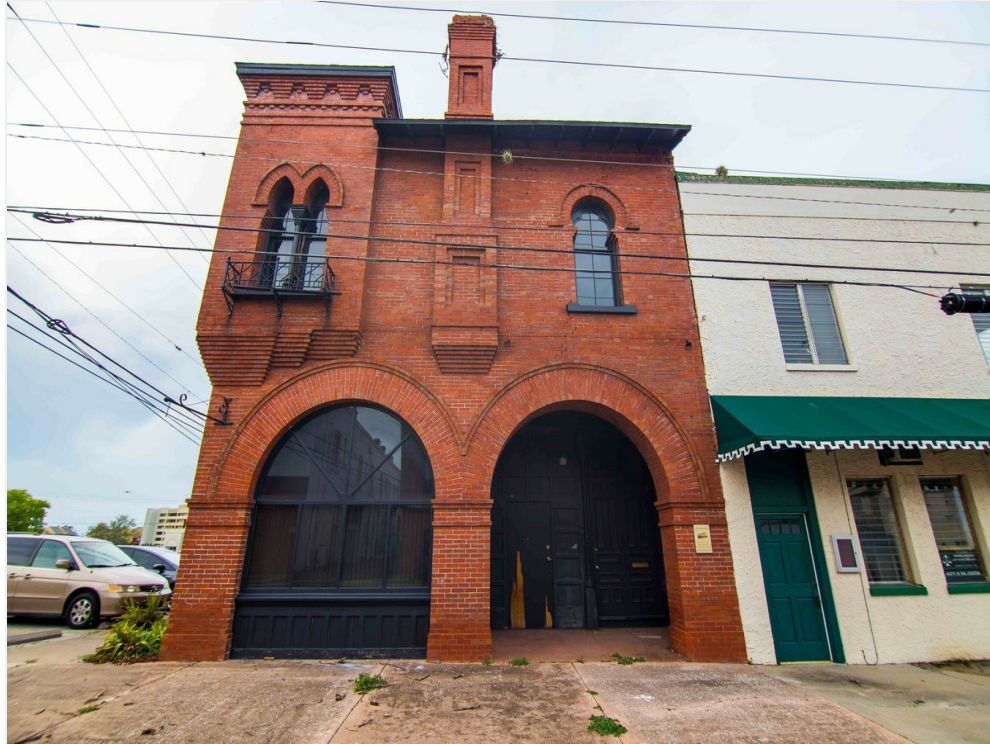
The closeup of the side view the left corner of PICO Building