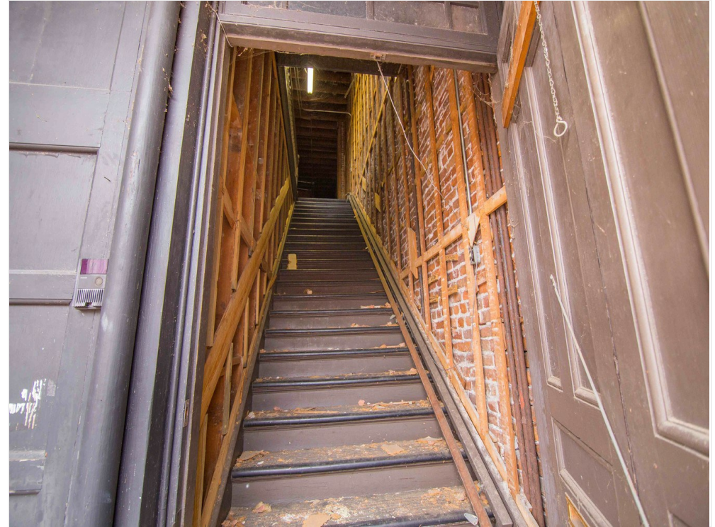
The stairs to the 2nd floor