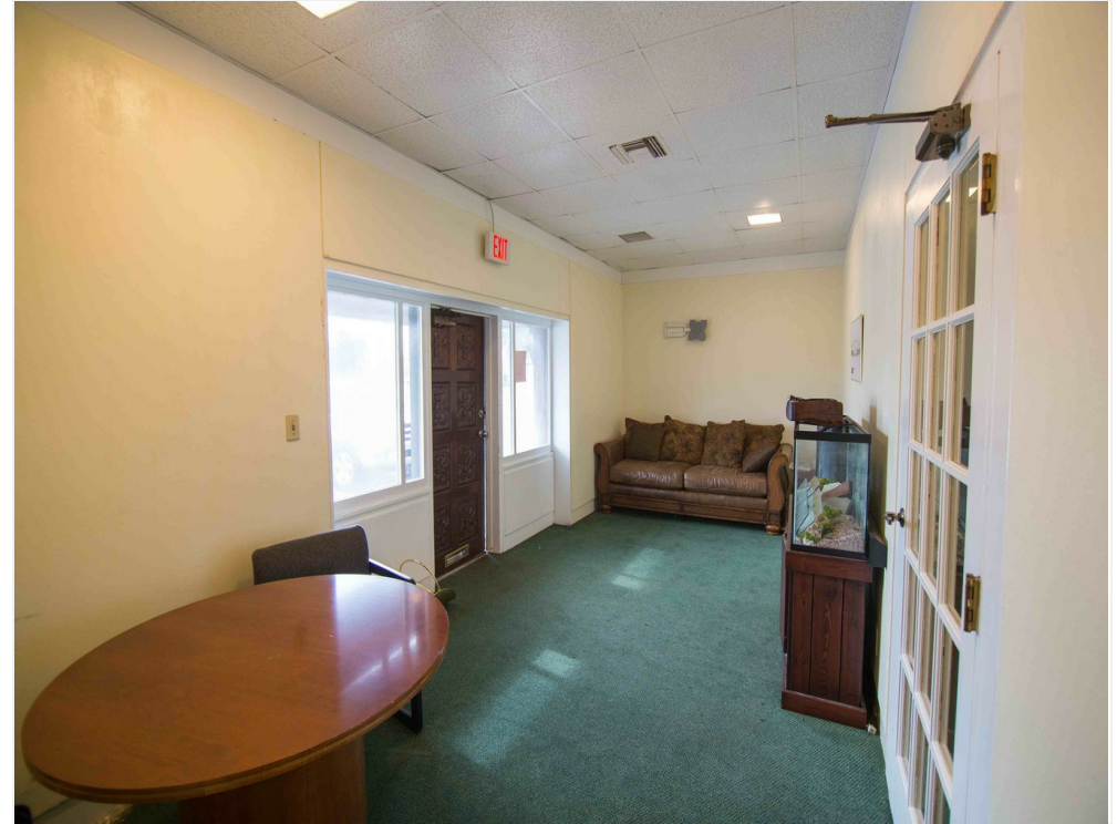
1st floor Reception area with view of original front door