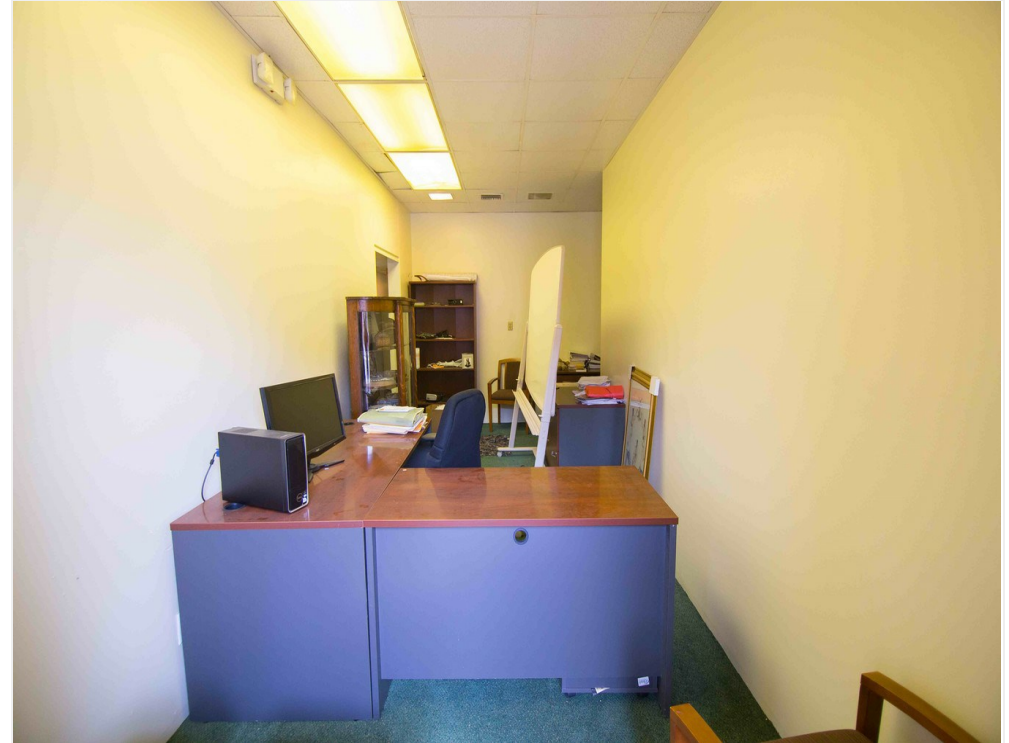
1st floor another office space in right wing