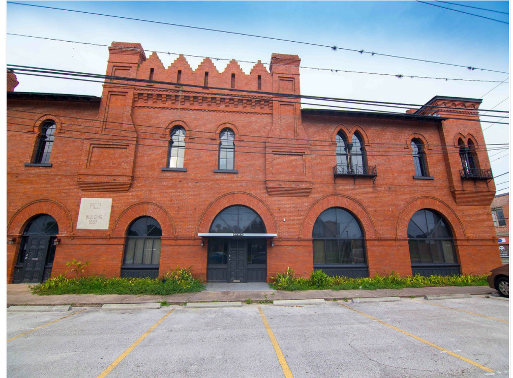
The front entrance with the original door