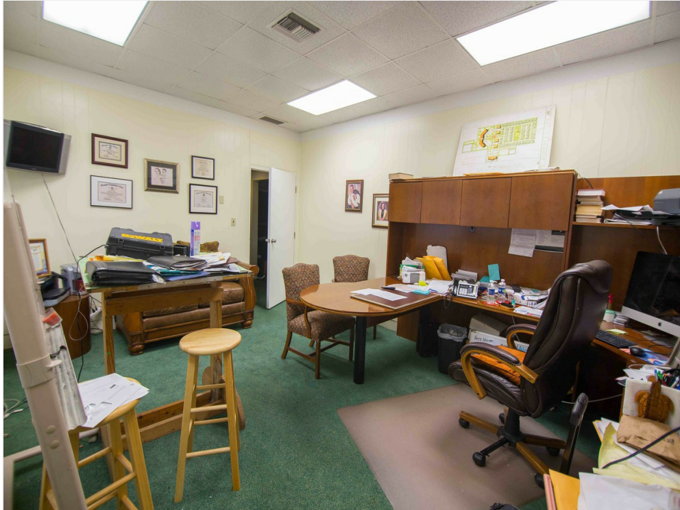
1st floor right wing of the building - Manager's office - with view of the entrance door