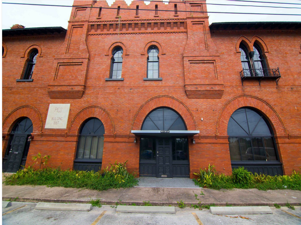
The closeup of front entrance and the plaque The PICO Building