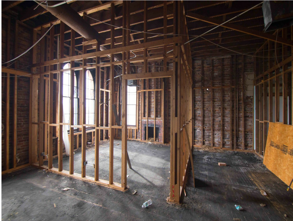
The spaces are divided and ready for the walls to go up