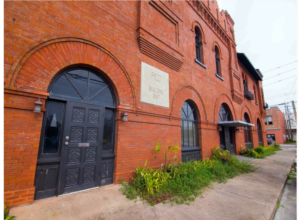
The view of the original doors