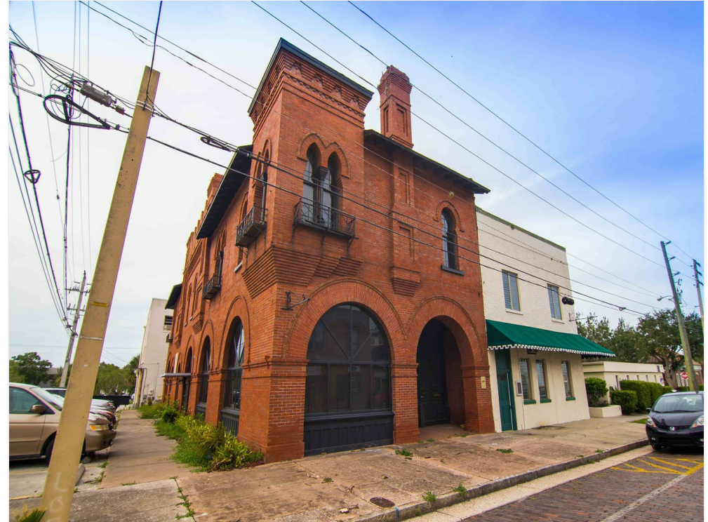
The side view of the left corner of PICO Building