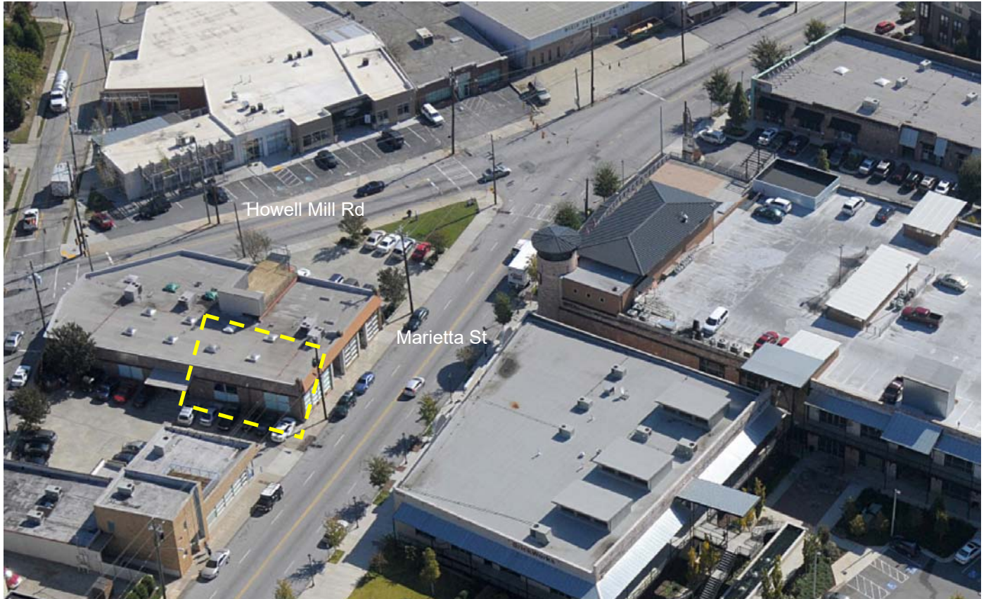
Midtown West Area at the intersection of Howell Mill Road and Marietta Street