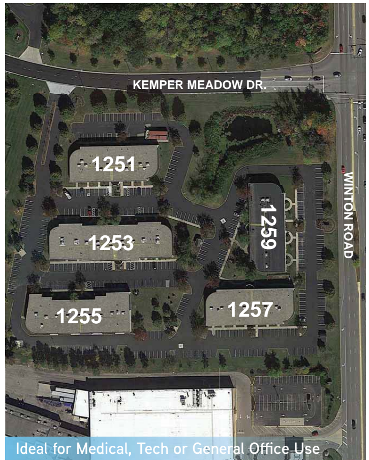
Ideal for Medical, Tech or General Office Use