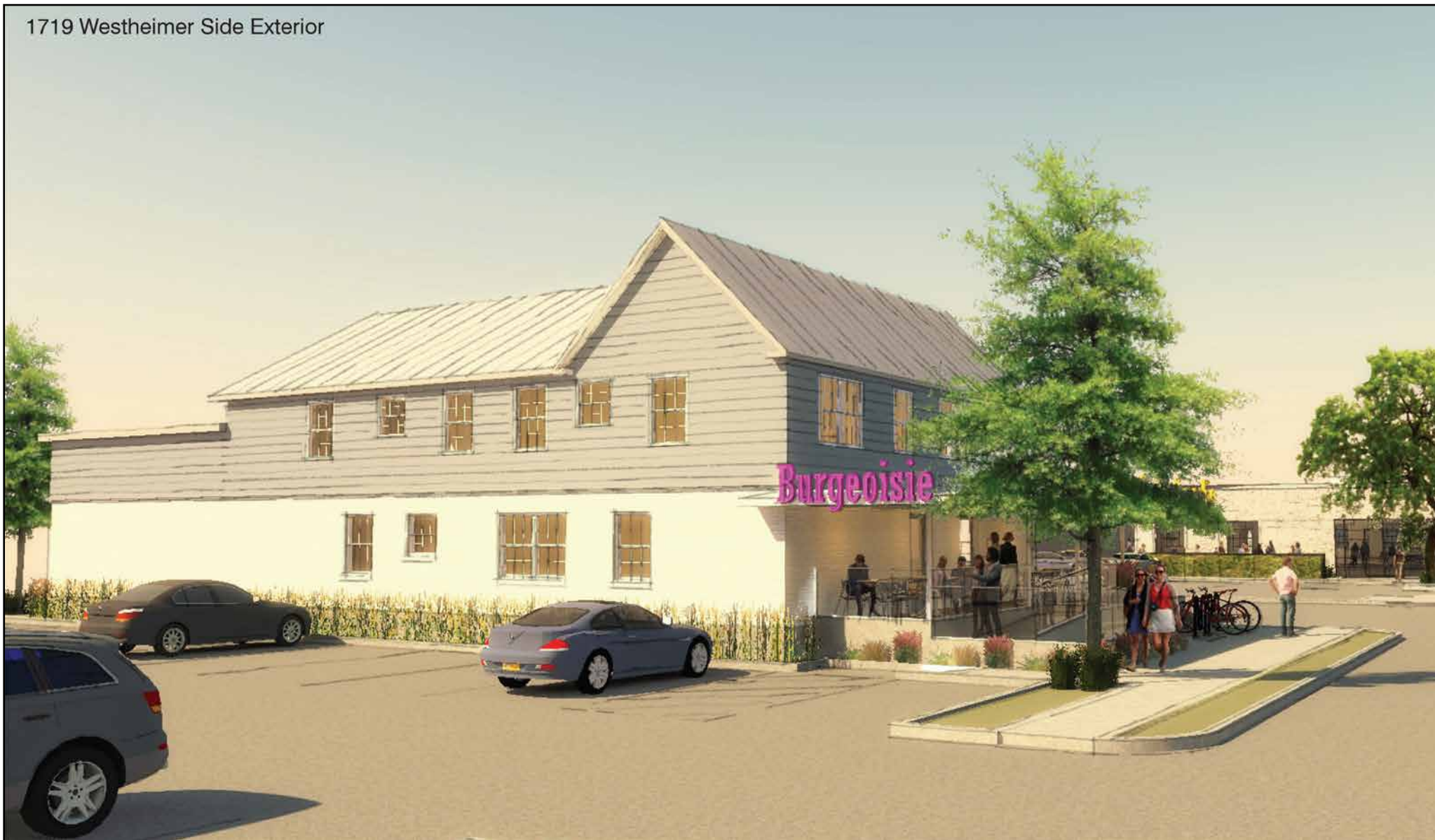
1719 Westheimer Side Exterior

"The information contained herein was obtained from sources believed reliable; however, Davis Commercial makes no guarantees, warranties, or representations as to the completeness or accuracy thereof. The presentation of this property is submitted subject to errors, omissions, change of price or conditions prior to sale or lease, or withdrawal without notice."