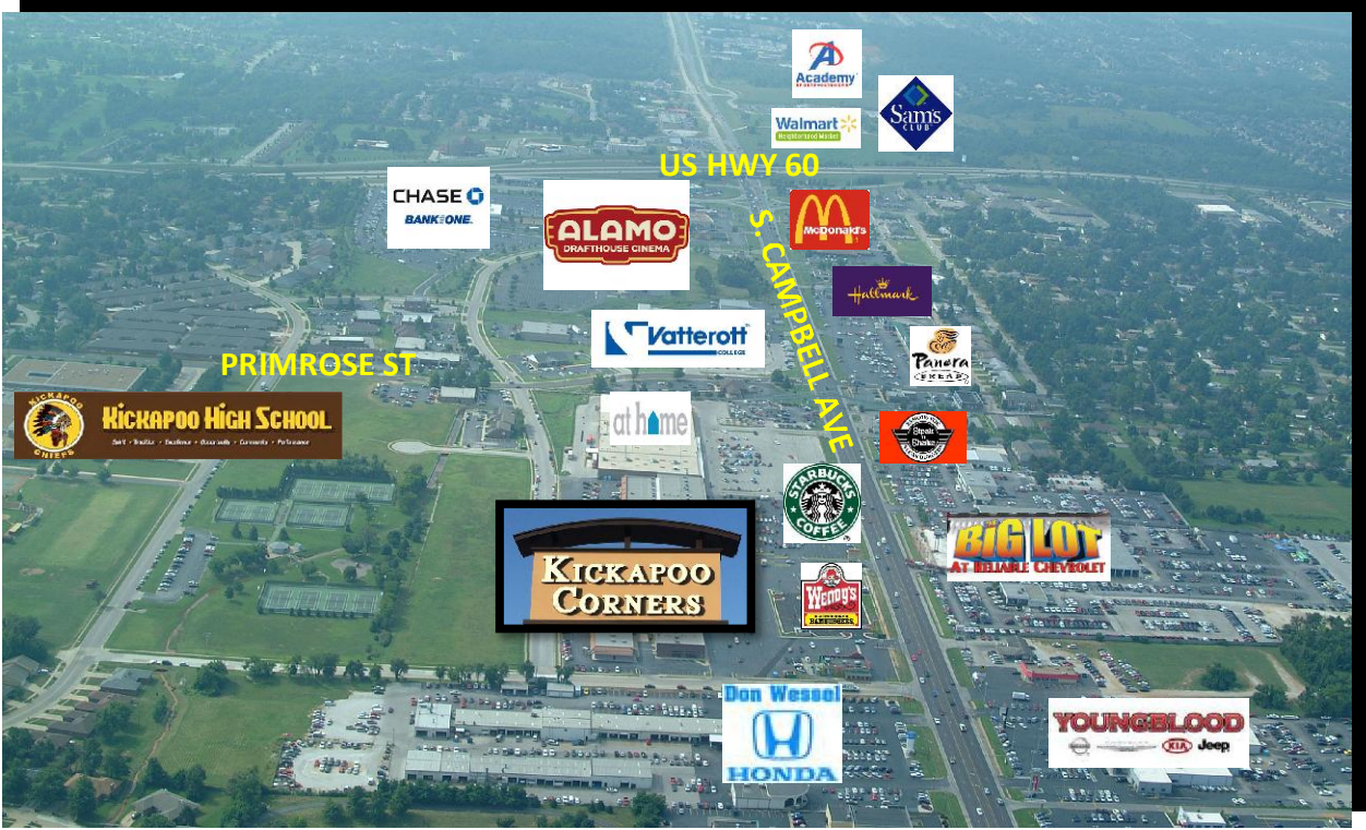
Kickapoo Corners View to the South