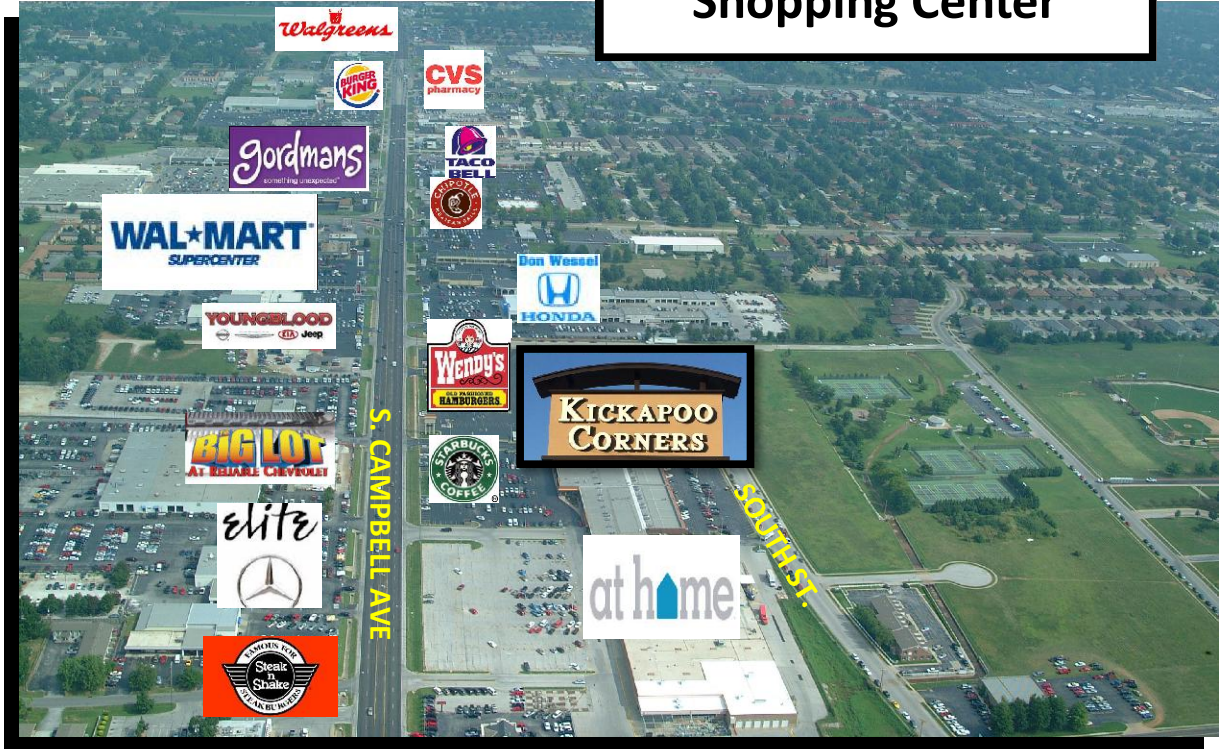
Kickapoo Corners View to the North