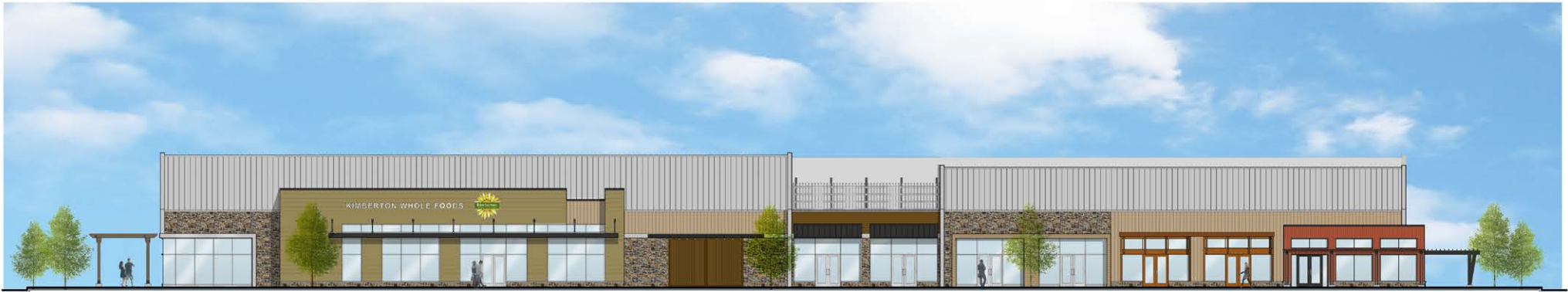
1 SOUTH SIDE ELEVATION (FRONT) A-201 SCALE: 3/32" = 1'-0"

The information and images contained herein are from sources deemed reliable. However, Metro Commercial Real Estate, Inc. makes no representation whatsoever as to their accuracy or authenticity. Images shown may be modified for illustrative purposes. Images may be out-of-date and not current. 2.28.18