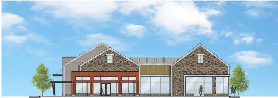
2 EAST SIDE ELEVATION (RIGHT) A-201 SCALE: 3/32" = 1'-0"