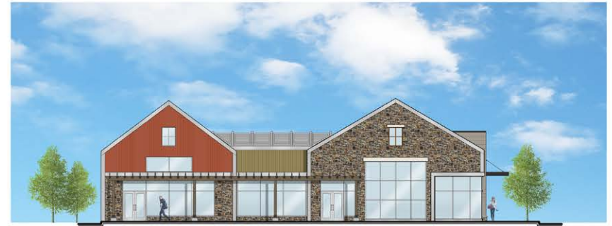
3 WEST SIDE ELEVATION (LEFT) A-201 SCALE: 3/32" = 1'-0"