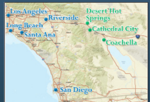
Southern California Vicinity Map

For further information, please contact: