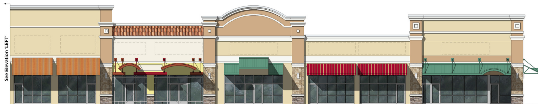
PARTIAL ELEVATION - RIGHT