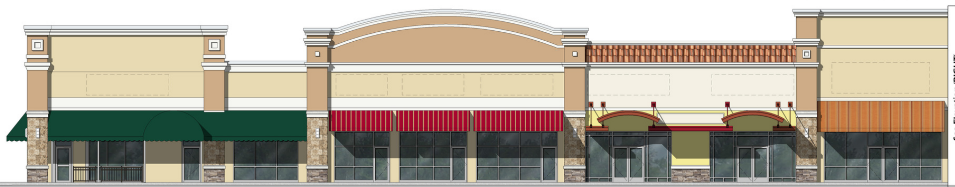
PARTIAL ELEVATION - LEFT