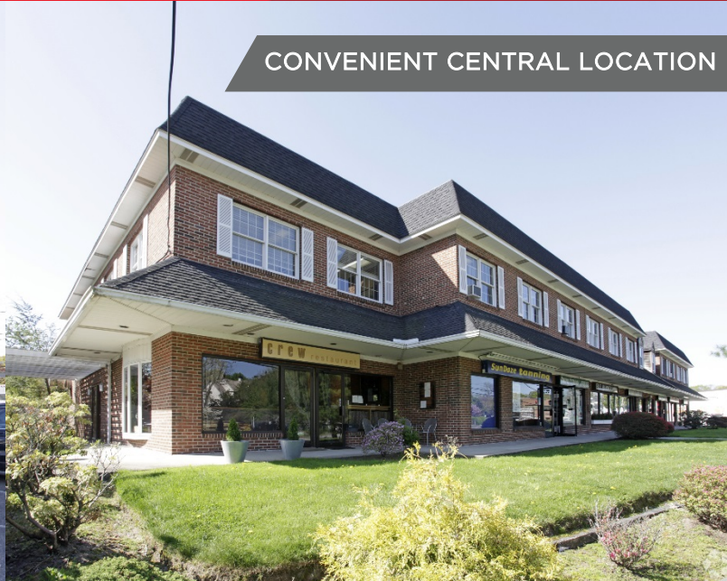
CONVENIENT CENTRAL LOCATION