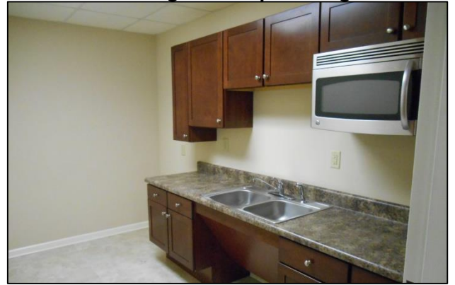
Modern Break Room