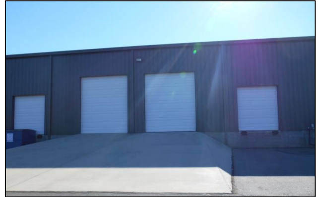
Dock High & Ramp Loading

5,062 Total Square Feet 1,300 SF OFFICE Approximately 3,762 SF WAREHOUSE Approx.