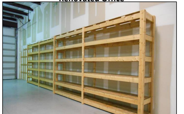
18' Clear Height & Finished Concrete Floors