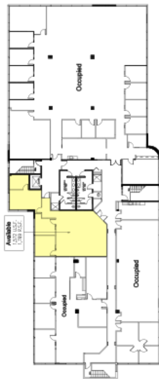
2nd Floor 436 Amherst Street Nashua, NH Date: January 7, 2015 Map to Scale

436 Amherst 436 Amherst Street, Nashua, New Hampshire 03063