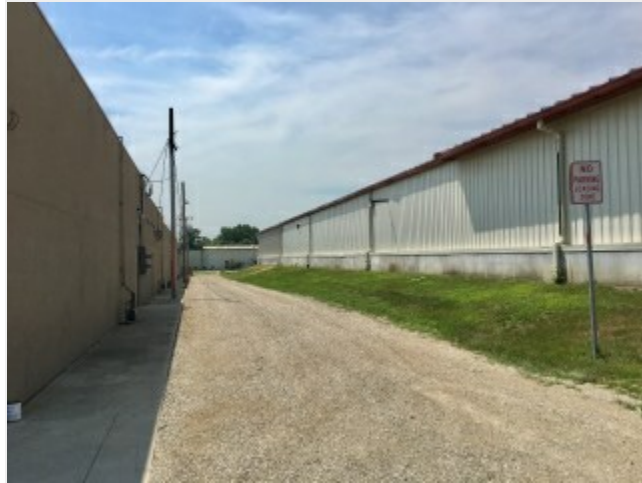
Monroe Plaza South Alley Access

620,630,636,642, South Monroe Avenue, Mason City, IA 50401