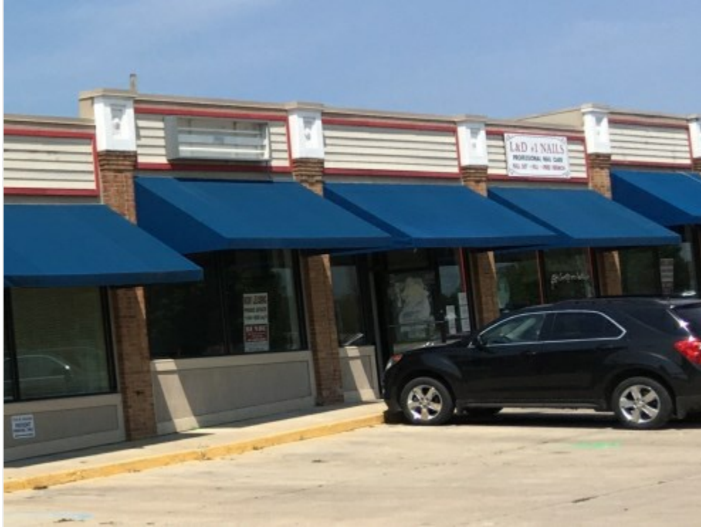
642 S Monroe, Mason City, Iowa