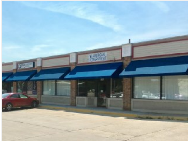
630 S Monroe, Mason City, Iowa

620,630,636,642, South Monroe Avenue, Mason City, IA 50401