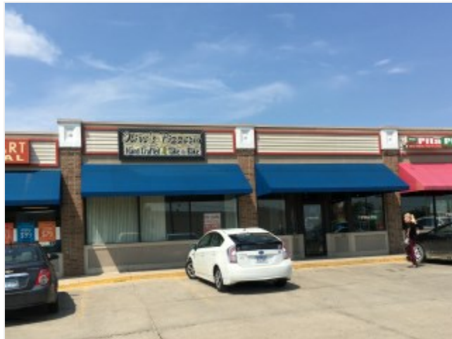
620 S Monroe, Mason City, Iowa