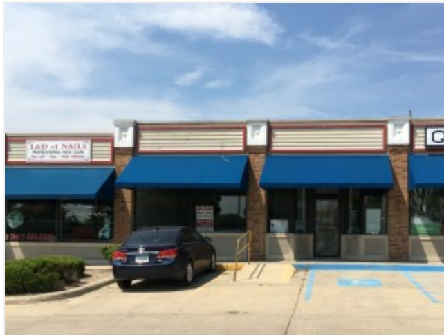
636 S Monroe, Mason City, Iowa